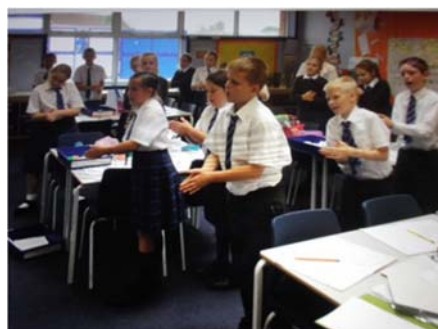
Performing our story.