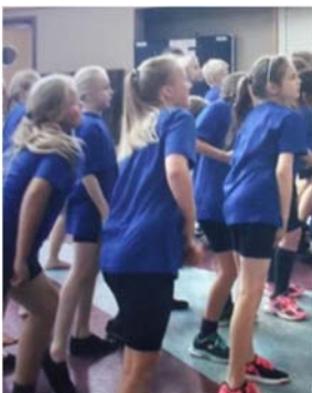
Performing our dance.